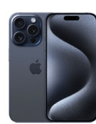
iPhone 15 Pro 256GB

Net Deposit 20,000 USD Trade Volumes 3,000 (Standard Lots)