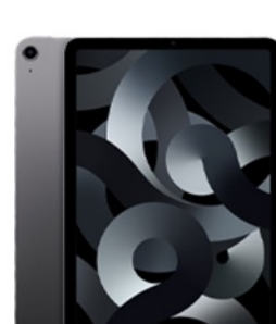
iPad Air 10.9-inch Wi-Fi 64GB

Net Deposit 8,000 USD Trade Volumes 450 (Standard Lots)