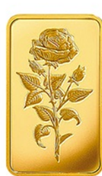
Emirates 10 Gram Gold Bar

Net Deposit 9,000 USD Trade Volumes 900 (Standard Lots)