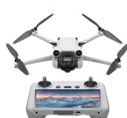
DJI Mini 3 Pro (DJI RC)

Net Deposit 12,000 USD Trade Volumes 1,000 (Standard Lots)