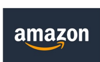
Amazon Vouchers 100 USD

Net Deposit 1,000 USD Trade Volumes 60 (Standard Lots)