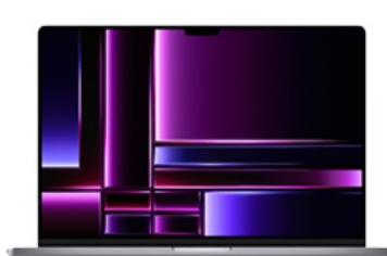
MacBook Pro 16" inch 16GB 1TB SSD

Net Deposit 40,000 USD Trade Volumes 2,000 (Standard Lots)