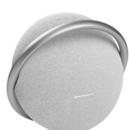
Harman Kardon Onyx Studio 7 Bluetooth Wireless Portable Speaker

Net Deposit 3,000 USD Trade Volumes 200 (Standard Lots)