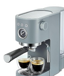
Ihomekee Coffee Machine

Net Deposit 1,500 USD Trade Volumes 150 (Standard Lots)