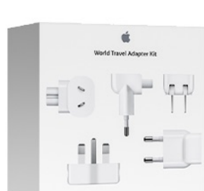
Apple world travel adapter

Net Deposit 1,000 USD Trade Volumes 60 (Standard Lots)