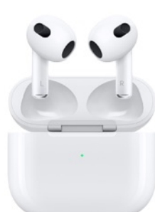
AirPods Pro (2nd generation) with MagSafe Case (USB-C)

Net Deposit 6,000 USD Trade Volumes 400 (Standard Lots)