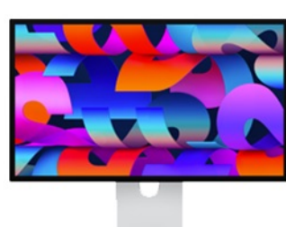
APPLE Studio Display nano glass with adjustable stand (applecare+)

Net Deposit 80,000 USD Trade Volumes 6,000 (Standard Lots)